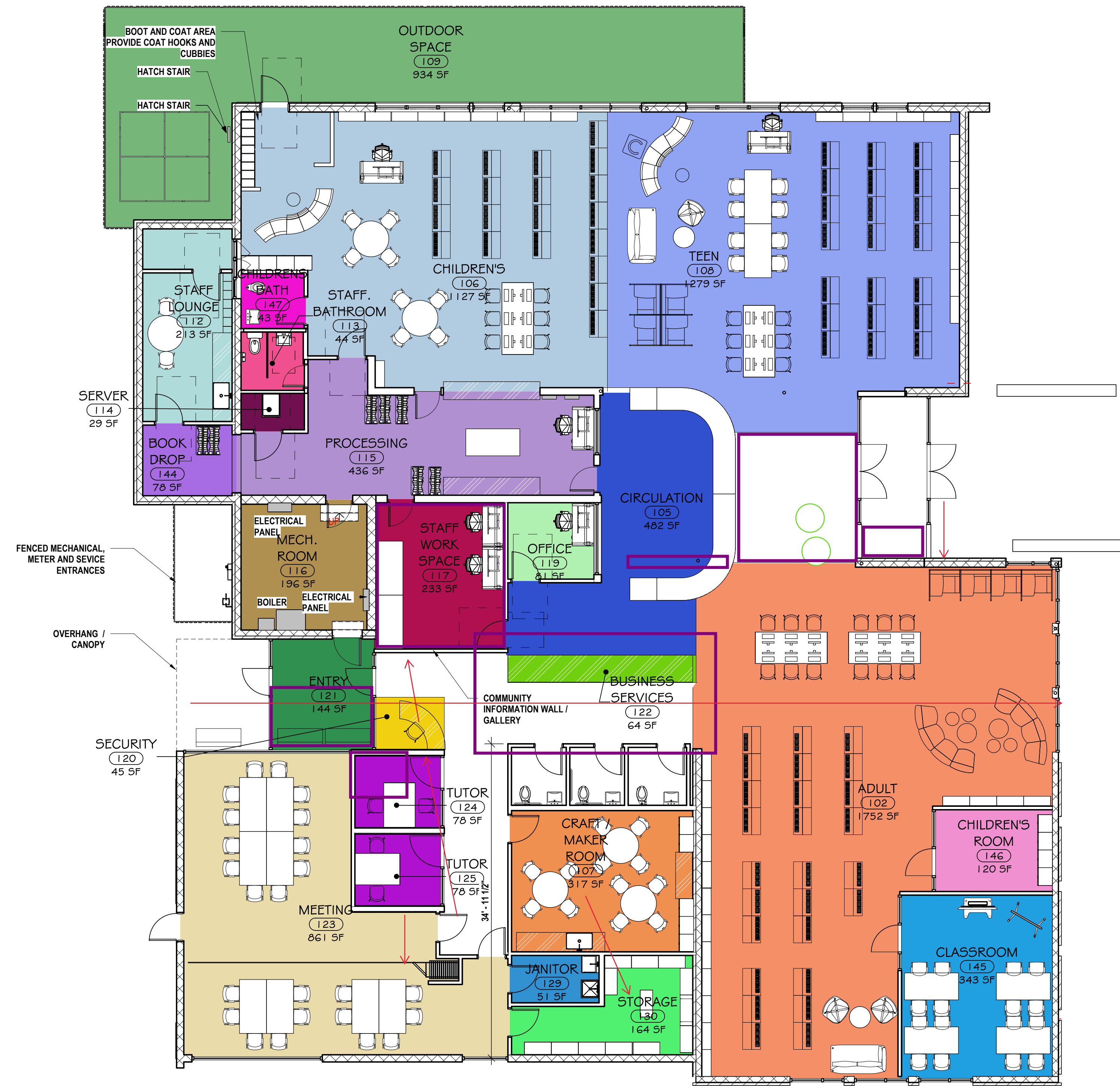
1 OPTION - 6 FIRST FLOOR PLAN 1/8" = 1'-0"